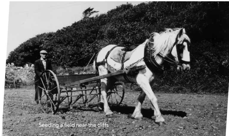
Seeding a field near the cliffs

After the Romans, but before the Normans, in the last few centuries of the first millennium AD, the patterns of settlement and farming that still underpin