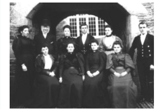
Early 20th century staff

Strip fields were generally enclosed earlier in Cornwall than up-country, from as early as the 13th century, and as communalism broke down so the importance of individual farmers grew. Most hamlets had shrunk to single farms by the end of the Victorian period, but farming regimes seem to have remained largely unchanged from medieval times until the middle of the 20th century. Under this convertible or ley husbandry,