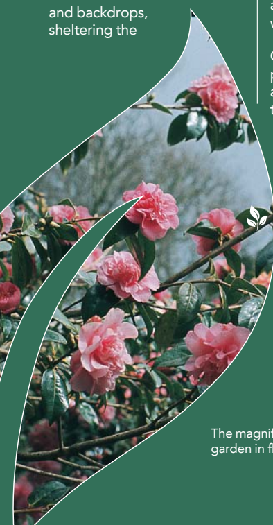
The magnificent garden in flower

Caerhays is now the area's principal estate, but as late as the early 19th century there were other important houses and manors nearby at Tretheake, Trevenen and Trevithick. Indeed the western and eastern parts of the current core estate of Caerhays were acquired from Tretheake and Trevenen.