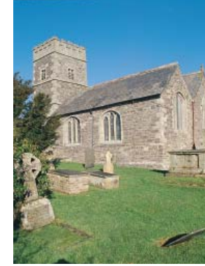
St Michael Caerhays church

any particular field (or bundle of strips) would be cultivated for just three or four years before being put down to pasture and hay grass for around twice as long. Over six, seven or eight years the grass developed a densely matted turf which, in the process known as beat-burning, was skimmed off, dried and burnt, and then the ashes scattered with other dressing material (dung, sea sand, sea weed, ditch cleanings etc) in advance of ploughing.